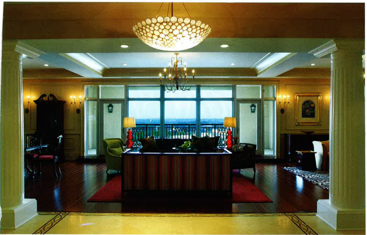
Above: The view from Kevin and Leslie Archer's penthouse stretches for miles, showcasing horizon sunsets over the foothills of western North Carolina.